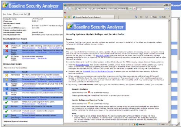
Microsoft Baseline Security Analyzer Report