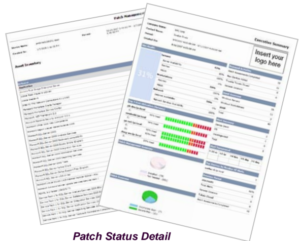
Patch Status Detail Server Health Report