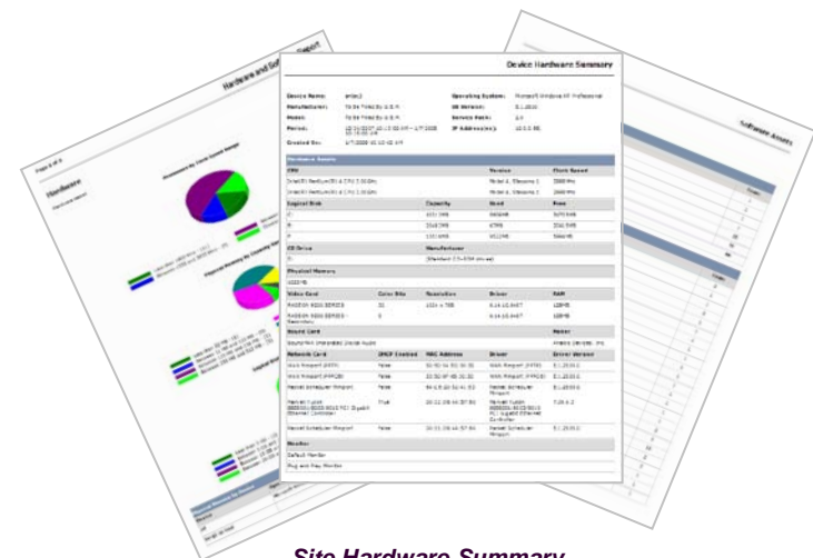
Site Hardware Summary Device Attributes Software Asset Inventory