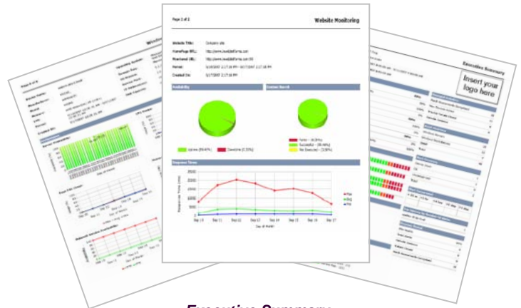
Executive Summary Website Availability Site Performance